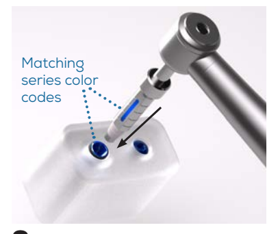
3 Firmly press the implant driver (handpiece or ratchet) into the implant until it clicks. Then pull the implant out of the container. Be sure to use the driver that matches the series of the implant.