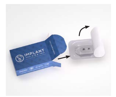
1 Remove the tray from the implant box, and peel back the tray cover, exposing the implant container.