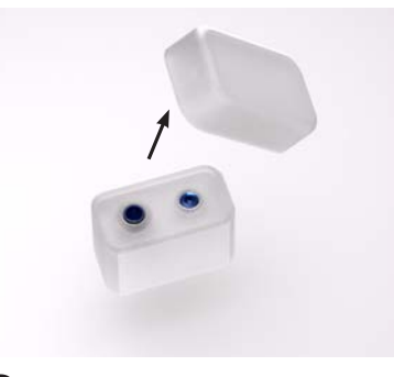
2 Remove the implant container from the tray, and then remove its cap.