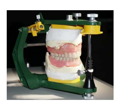
5 APPT 4: When case is returned from the laboratory, try in denture setup. Make adjustments as necessary before processing final restoration.

4 APPT 3: When case is returned from the laboratory use the base plate and wax rims to register jaw relations. Send to laboratory.