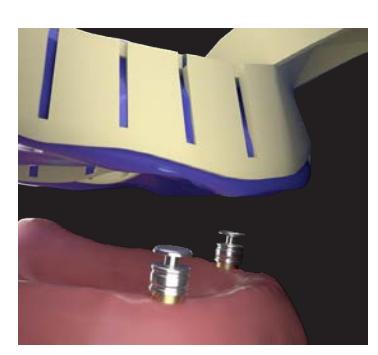
3 Using the custom tray, take a second impression with the appropriate impression copings over the abutment. Send impression to the laboratory for master cast, base plate and wax rims for jaw relations.

Torque specifications: 300 Series: 20 Ncm 400 & 500 Series: 30Ncm