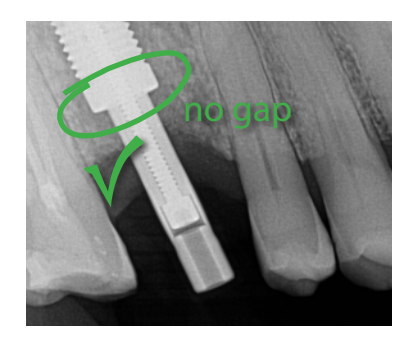
4a.5 X-ray to verify proper seating of the impression post. There should be no gap between the implant and the impression post.