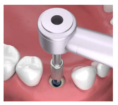
4a.3 Use the Bone Profiler Kit to remove excess bone and tissue that has grown over the top of the implant. See page 47.