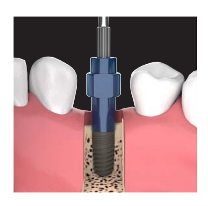
4a.4 Align the appropriate series impression post into the implant. The impression post has a hex on the bottom which will fit into the internal hex in the implant. Finger tighten with .050 hex tool.

Products illustrated in this procedure: IR3-3508-00 implant, HDT-0050-00 hex driver,