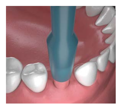
4a.1 Remove tissue over the implant using a tissue punch or surgical blade.