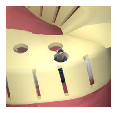
4a.6 Customize the open tray so the impression post sticks out through the tray during the impression.