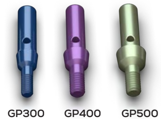
GP300 GP400 GP500

The guide pins are color coded for each of the Implant One platforms.